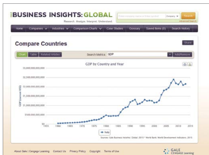
Gale Business Insights: Global – Interactive LiveChart