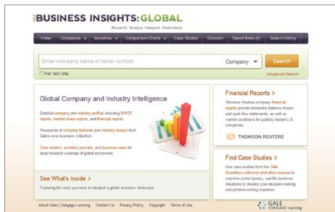
Gale Business Insights: Global – homepage