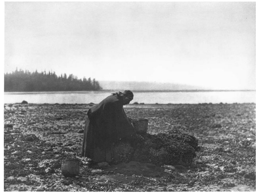
Suquamish woman gathering shellfish.

The six analyses I carried out in Gale Digital Scholar Lab were: