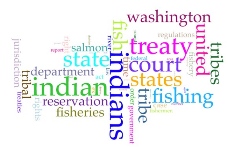
Voyant Cirrus Tool Visualization

Using the Cirrus tool with my customized text-cleaning configuration and stop-word list, I learned that aside from the terms that I expected to be the most prominent including "indian", "treaty", "court", and "fishing", phrases such as "reservation", "jurisdiction", "department", and "tribes" were also included. From this word cloud, I am beginning to understand that the majority of my content sets are actually legal documents. This is because much of the language used is very formal with legal terms included. It is also important to note that the documents are also fairly old, as the term "indian" comes up very frequently. Referring to indigenous peoples as "indians" is still prevalent today, but it is not politically correct, therefore for the term to be used in legal documents, I would assume that the documents were written in the past, prior to the cessation of the term "indian." This visualization is useful in answering my research question as it displays tribal names and other words that point to reasons behind disputes. I did not curate any additional data for this analysis.