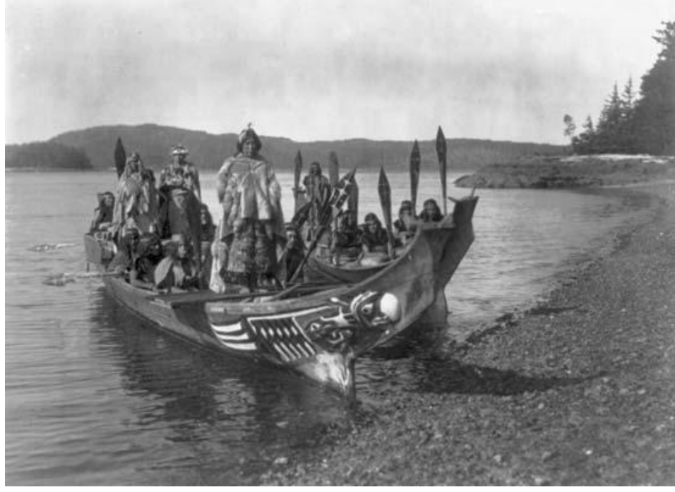
Coast Salish people in a canoe

What I have found unexpected about text mining investigations is the exclusion of Indigenous voices in this field. This class has taught me how humanities and technology can intersect.