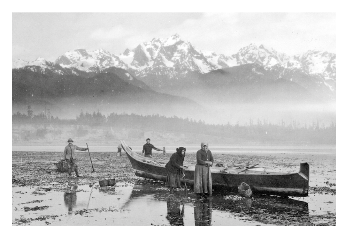
Clamming at low tide in Sequim Bay late 1800s.