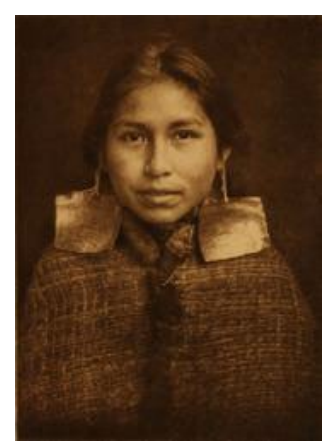
Portrait of a young Cowichan woman