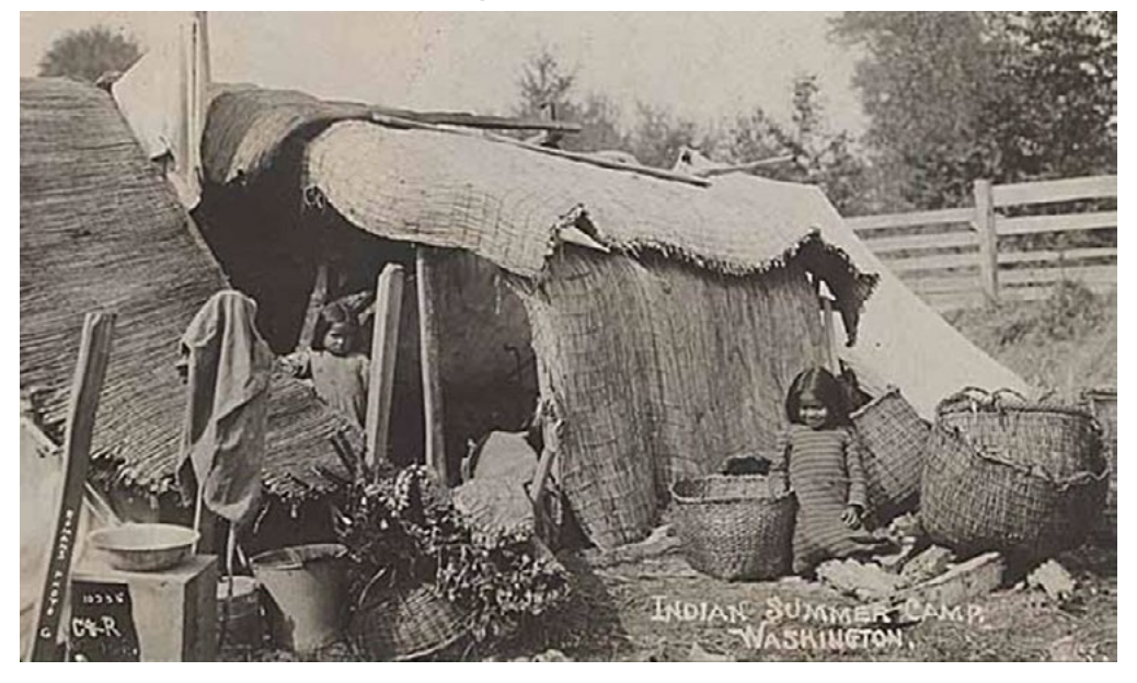
Summer Cattail Mat Shelters.

To my surprise, the state of the texts I found was very tidy. The OCR levels were mostly above 80%, and many of them were about 90%. I believe that this is because most of the documents I found are official records of court cases, which are typed in English. I have very few handwritten materials, which could account for why the OCR levels of my documents are so high. However, the OCR levels of some of the treaties are a bit lower. I think this is because the treaties tend to be older, some from the 1800s. In addition, the indigenous names are not always recognized as proper English by the OCR, which could bring its level down a bit.