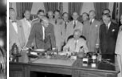
President Harry S. Truman at his desk in the Oval Office signing H.R. 5632, the National Security Act Amendments of 1949, August 10, 1949. No photo is available of the signing of the original 1947 Act because Truman signed it while aboard the presidential aircraft.