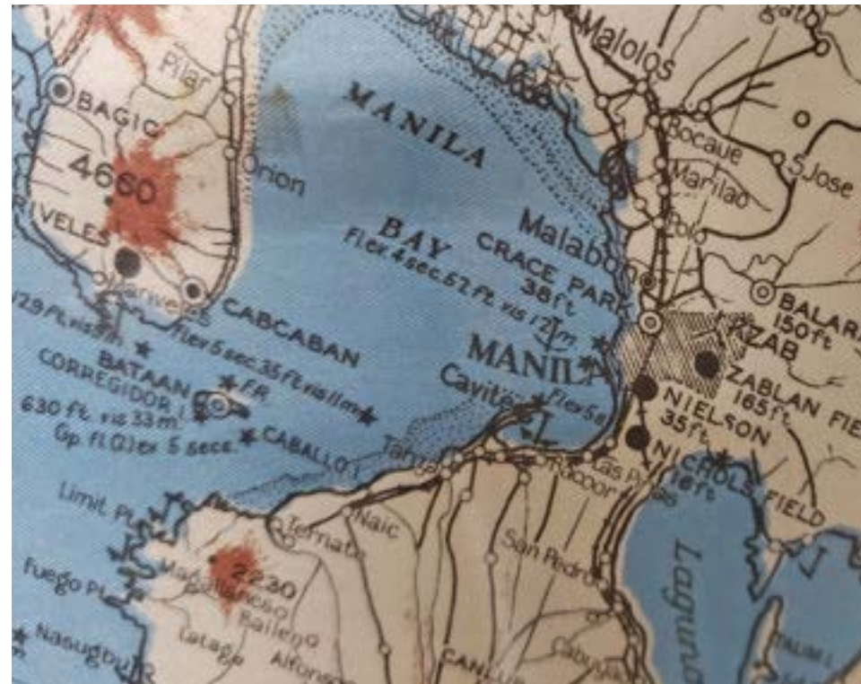
World War II Royal Australian Air Force Map of the Manila Area.