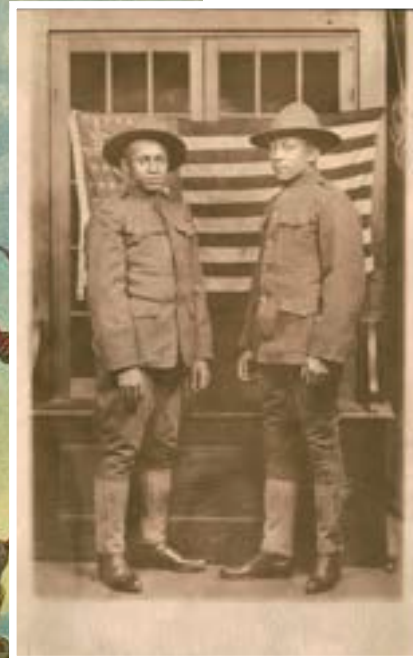
Two unidentified African American soldiers in uniforms and campaign hats standing in front of American flag, between 1917-1918.