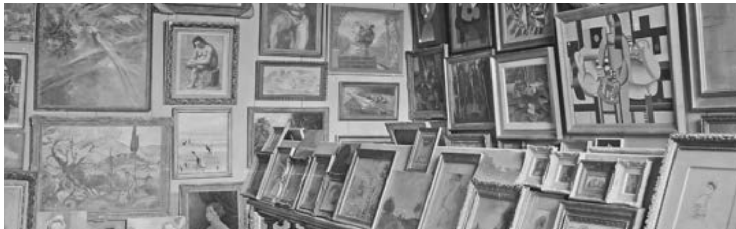
"Salle des Martyrs," Museum of the Jeu de Paume, Paris, c.1940.