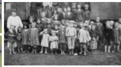
53 Jewish orphans at Lwów [Lviv, Lvov, Lemberg], Ukraine.