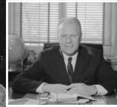
Congressman Gerald Ford, January 1963.

The heart of the collection is the correspondence. Although it is sometimes perfunctory and formal on matters of official business, much of it is intimate and eloquent, a caring reflection of the times, issues, personalities, family responsibilities, and Stevenson's devotion to people and their causes. His affection and support of family, especially his three sons, is self-evident. He was, and appears, in this correspondence the most unaffected and generous of humans, never too busy or distracted for friends. The universality of his "constituency" is extraordinary, a hint of what the American statesman can be in an expectant world. His correspondence is not weighted with industrialists and financiers but draws from the worlds of the arts (including admiring movie stars), journalism, law, theology, labor, social work, diplomacy and government, education, economics, philosophy, and philanthropy. From around the world, this collection brings wise, good, and talented people to life, most allied by one means or another in common purpose with the Guv. Anyone seeking the obscene or even the unkind word will be disappointed. The comments from the Guv and his correspondents are bereft of self-interest or gratification, reflecting a different man—and time.