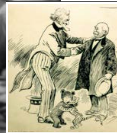
Cartoon shows Uncle Sam shaking hands with former French Premier Georges Clemenceau as he disembarks from a ship. Probably published in The Evening Star (Washington, D.C.), 1922.