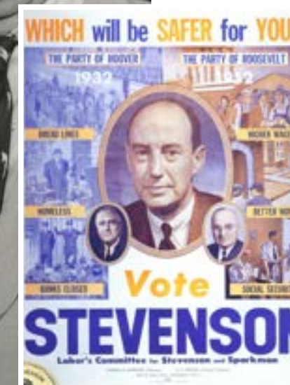
Labor's Committee for Stevenson & Sparkman campaign. Democratic party poster 1952 for Adlai Stevenson. No copyright.

such as Hakhaluts (the Pioneer), Hano'ar Hatsioni (Zionist Youth), Hano'ar Ha'ivri (Hebrew Youth), and Hakhaluts Khaklai Tsioni (Zionist Pioneer in Agriculture) were all active in accelerating the politicization and secularization of the Jewish generation born after the first World War.