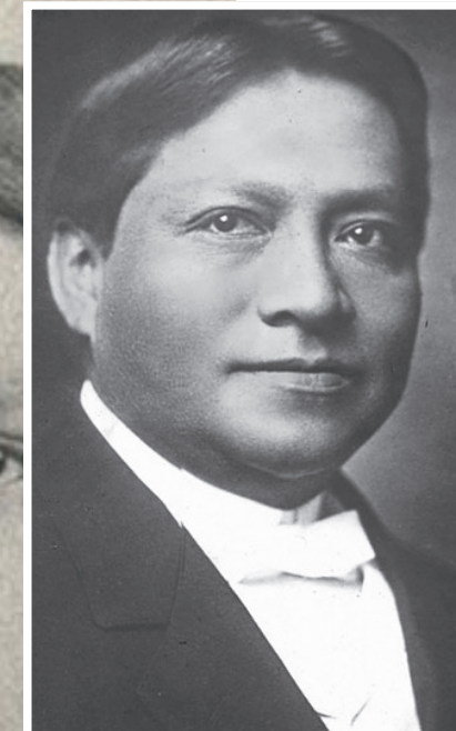
Carlos Montezuma, 1896.