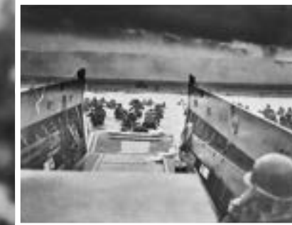
Library of Congress Prints and Photographs Division.