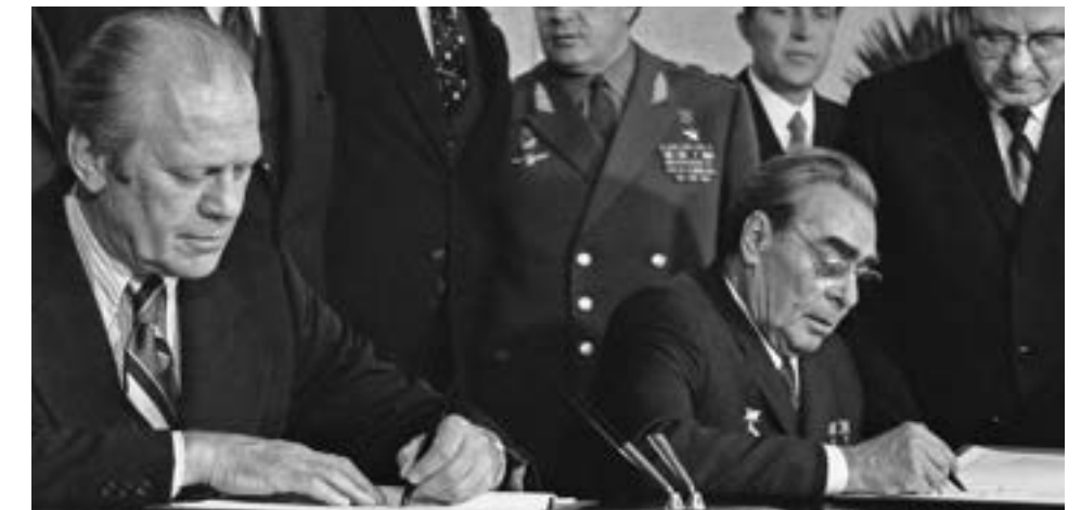
President Gerald Ford and Soviet General Secretary Leonid Brezhnev signing a Joint Communiqué on the Limitation of Strategic Offensive Arms following their bilateral talks in the conference hall of the Okeansky Sanatorium, Vladivostok, USSR, 1974.

In the two and a half years of his presidency, Gerald R. Ford ended the U.S. involvement in the war in Vietnam, helped mediate a cease-fire agreement between Israel and Egypt, signed the Helsinki human rights convention with the Soviet Union, and traveled to Vladivostok in the Soviet Far East to sign an arms limitation agreement with Soviet President Leonid Brezhnev.